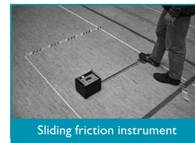
Sliding friction instrument

Even though the trade association only allows certain results using sliding friction testing machines, all surfaces on building projects must be able to be tested for slip safety. We recommend, as do leading surveyors, accompanying testing during and after application.