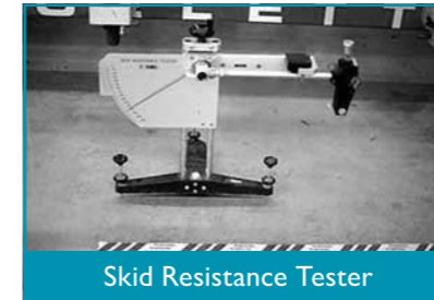
Skid Resistance Tester

The SRT pendulum test is used in Europe mainly to determine slip resistance in road construction, as well as for pedestrian zones and trafficked areas.